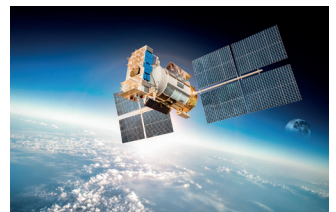
Security and aviation